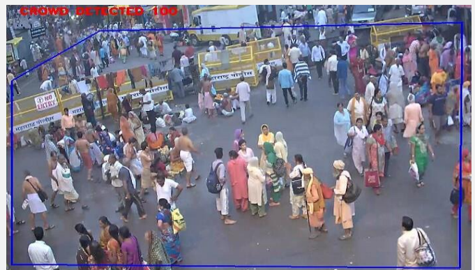
Crowd Monitoring in the Critical Areas of the Nashik City